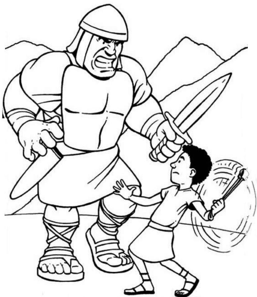
David & Goliath